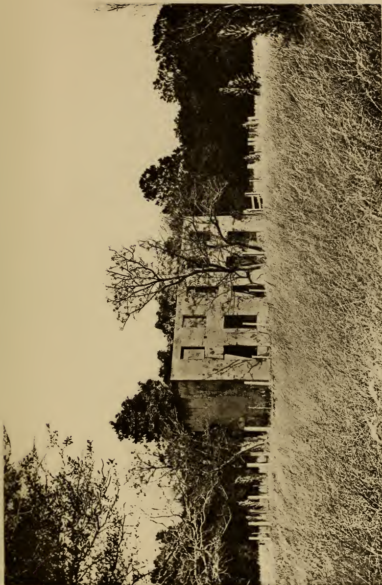
OLD TABBY HOUSE